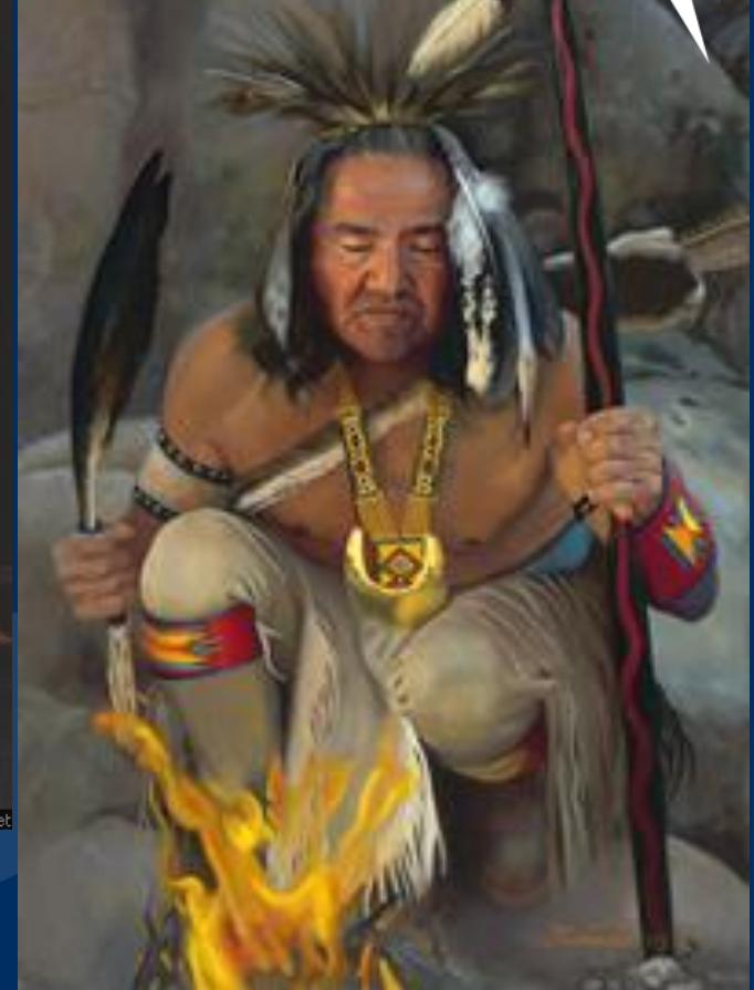
Early Morning Prayers in the Canyon