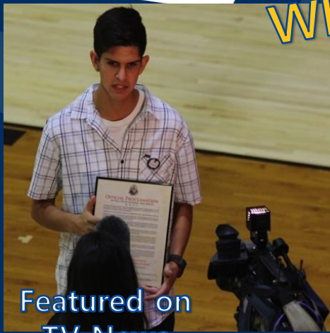
Featured on TV News