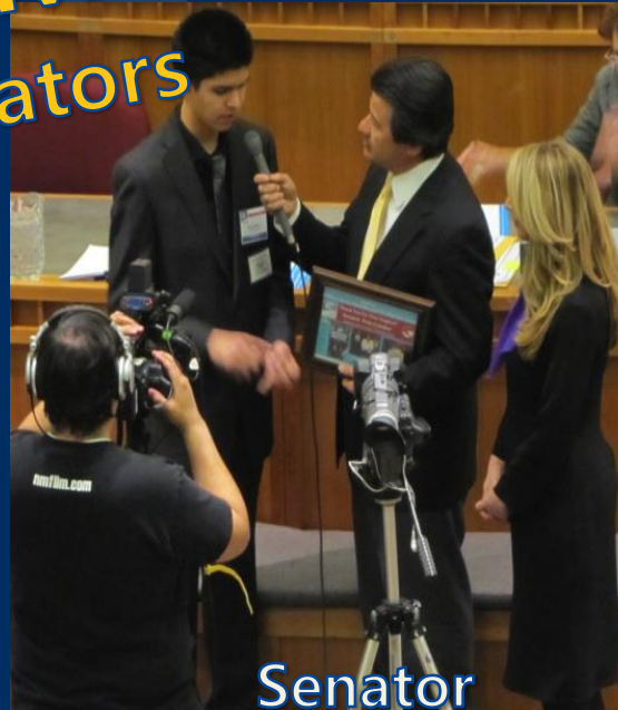
Senator Pete Campos