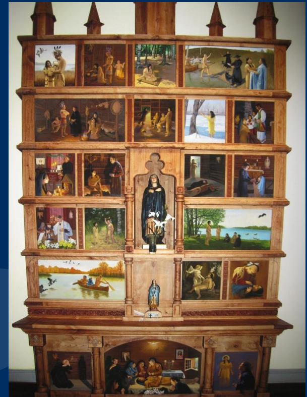
The life & Miracles of Kateri Tekakwitha Ohkay Owingeh Pueblo San Juan Church