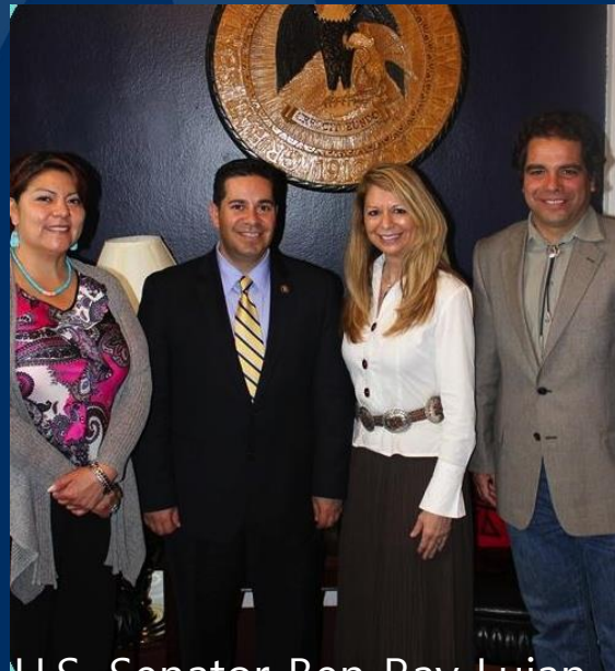
U.S. Senator Ben Ray Lujan