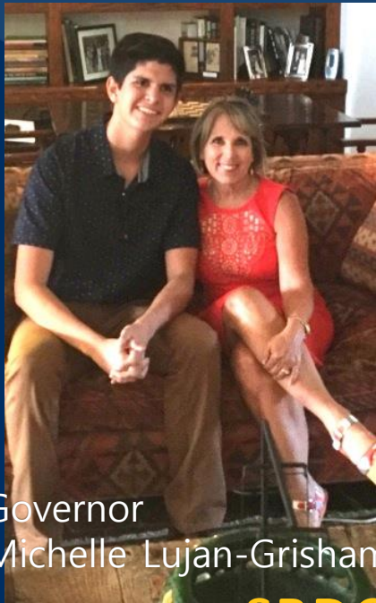
Governor Michelle Lujan-Grisham