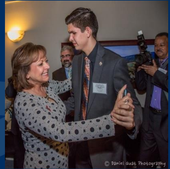
NM Governor Susanna Martinez

SBDC Mentorship Building Legislative Relationships