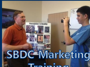
SBDC Marketing Training